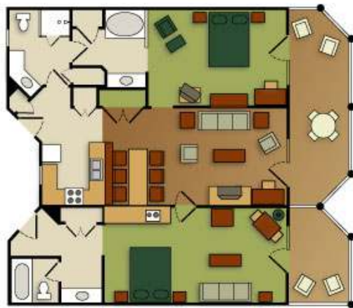
Lodge - 2 Bedroom 1,350 SQ FT