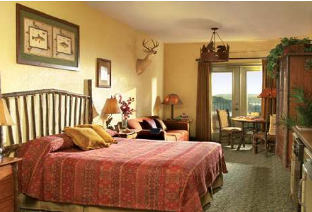
Attached studio apartment (w/ partial kitchen)

For more: https://www.bluegreenvacations.com/resorts/missouri/wilderness-club-big-cedar