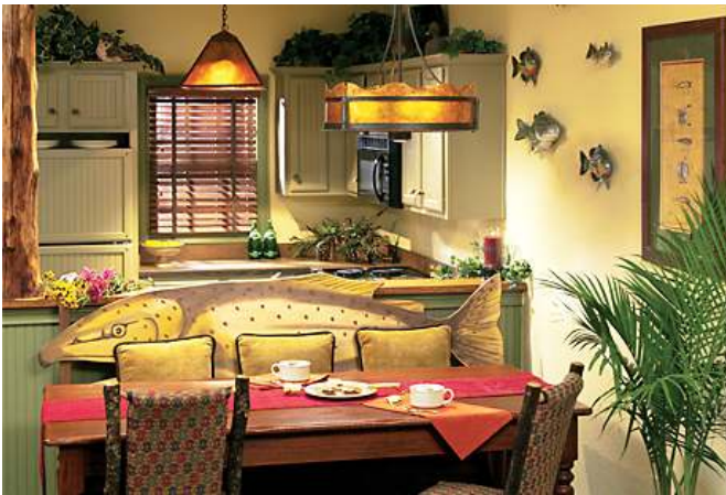
1 Bedroom Dining/Full Kitchen