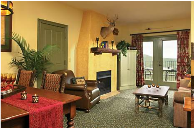
1 Bedroom Living Room