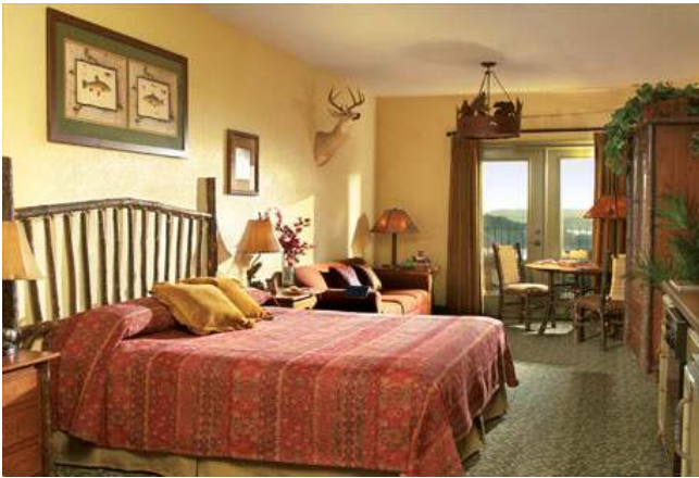
Studio apartment (w/ partial kitchen)